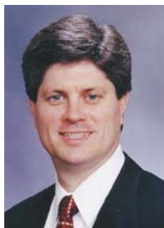
Jeff Fortenberry (R)